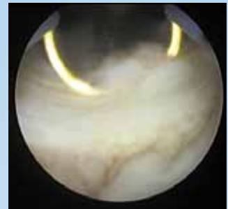
Rapid generation of arcs.