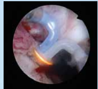
Homogeneous effects for the vaporization of tissue structures.

ERBE Elektromedizin GmbH Waldhoernlestrasse 17 72072 Tuebingen Germany Phone +49 7071 755-0 Fax +49 7071 755-179 sales@erbe-med.de www.erbe-med.com